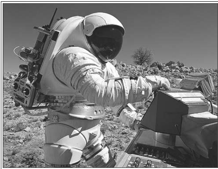
Johnson Space Center has been testing NASA's prototype spacesuits in the Flagstaff area since the '60s. This photograph is from a 2006 testing session. JSC and NASA are expected to be testing on Babbitt Ranch lands next spring.

With its lunar-like volcanism and impact craters, northern Arizona has long been considered well-suited for training NASA's astronauts for the six Apollo expeditions to the Moon. Next spring, geoscientists plan to test proto-type Lunar and Mars spacesuits and several robotic rovers from NASA engineering teams on the CO Bar Ranch.