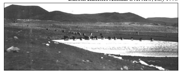
Babbitt Ranches Annual Overview, July 1998

He held the distinction of having been a passenger on the first train from Phoenix to Prescott while serving as a member of the Legislature.